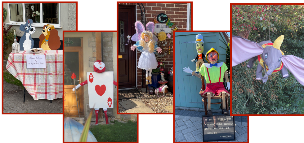
Some of the 2022 Scarecrows

The Uphill Village Society exists to preserve, promote and enhance the character and interests of the village of Uphill for the benefit of the village and residents. For more details visit www.uphillvillage.org.uk